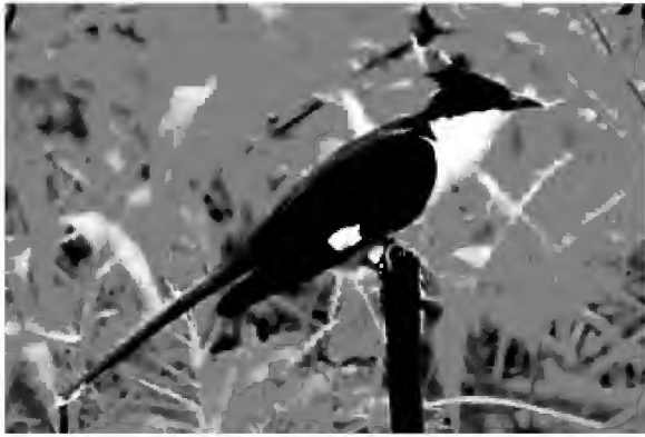
Pied Crested Cuckoo Clamator jacobinus

This was the first bird I saw on revisiting Hingolgadh years after my last trip as a student; they arrive in the beginning of monsoons, proclaiming its advent unmistakably with loud metallic calls.